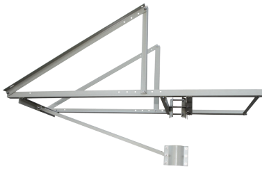
Optional Accessory: FL40