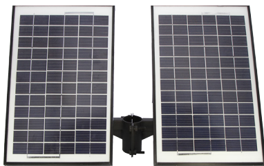
Optional Accessory: SP02