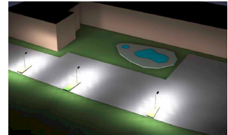
Complete 3D lighting renderings available for your application.

This compact, all-in-one, integrated, solar area light is offered in 60W, 80W or 100W LED power versions and includes a choice of 3M, 4M, 5M, or 6M column. This fitting features a choice of three different user/installer selectable operating modes. Programmed using an IR remote control (included). The solar panel is integrated into the top of the fitting and the LEDs are motion sensor are on the underside. Attaches to the top of a 76mm OD column or to the side (using an optional support arm). Choice of root mount or flange mount columns available.