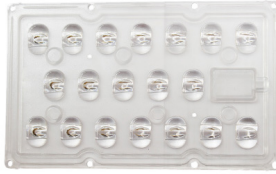
Asymmetric optical technology allows light to be directed forwards.